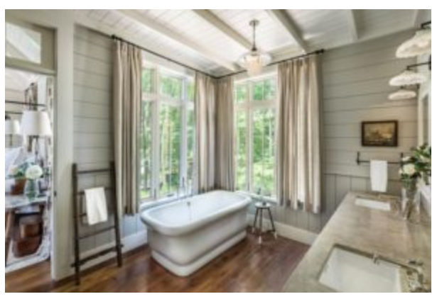
BALA winner Lake Keowee Cottage.

In single-family custom and production homes, architects and designers include benches and nooks because they're cozy, chic and practical, serving as places to snuggle up with the kids or a good book.